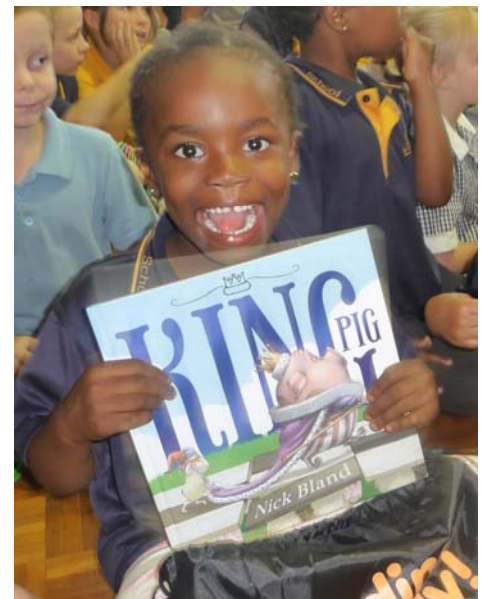
Happy student at Elizabeth South Primary School. Sponsored by Mainfreight Australia