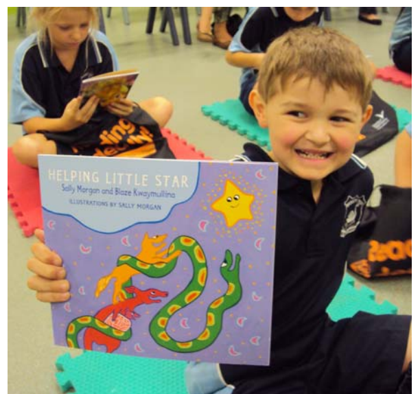
Helping Little Star - one of this term's great titles by Indigenous authors Sally Morgan & Blaze Kwaymullina

Providing access to books in remote Indigenous communities is a major aim for us here at Books in Homes, and it's thanks to our very generous sponsors like you that we are able to do our part. We also think it's very important to support Indigenous culture in all of its forms, which is why 25% of all Books in Homes titles are written by Indigenous Australian authors every term. We are very lucky to have some great titles by Indigenous Authors this term, such as Malu Kangaroo – a beautifully illustrated tale of how people first learned to surf, and Shake a Leg - a wonderful story of celebrating food, dance, and cultural understanding.