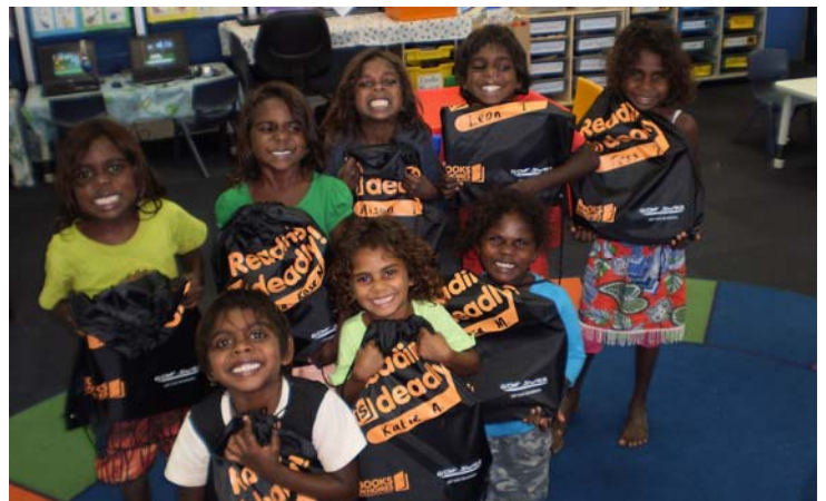
Nganmarriyanga School, NT. Sponsored by GDF SUEZ Bonaparte.