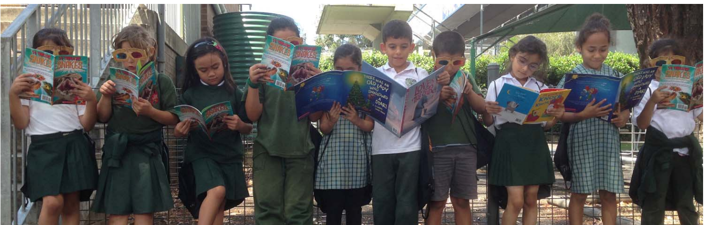
The kids at Wiley Park didn't waste any time getting into their books! Sponsored by the University of Western Sydney.